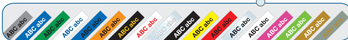
Labels shown are illustrative only. Actual output (such as font and margins) varies.

Creates durable, laminated labels in a variety of colors. Prints big, bold labels up to 18mm wide!