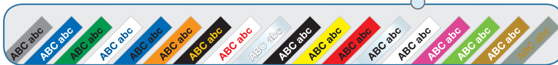
Labels shown are illustrative only. Actual output (such as font and margins) varies.

Creates durable, laminated labels in a variety of colors. Prints big, bold labels up to 18mm wide!