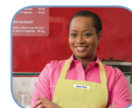
Iron-on Fabric Tape