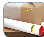
Extra Strength Adhesive Tape