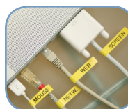
Wire and Cable Tape

For more challenging applications, a number of specialty tapes are also available*